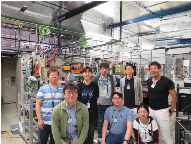
Fig. 1. The INTT collaboration at the Fermilab test beam facility in June 2019.

The design of silicon sensor and the high density interconnect readout cable were finalized after the first beam test. The next prototypes were considered as pre-production versions and new silicon ladders were assembled again to be tested in the next round beam